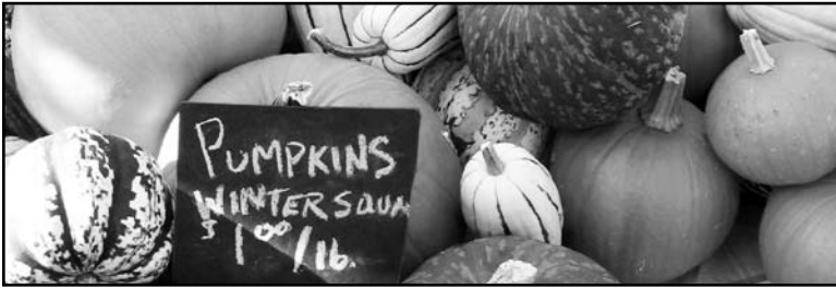
Pumpkins from Mountain Bounty Farm.

From Truckee, drive through the light and continue through town. Turn left at Grove Street (at the pharmacy) and drive 2 1/2 blocks. The house is located on the right just past 480 Grove Street and is set back from the street. There is a gravel pathway leading to the house. It is across the street from the elementary school where Fairway Street ends. Walk up the path and veggies will be in the small, tall shed on your right. Bring a headlamp for the pathway.