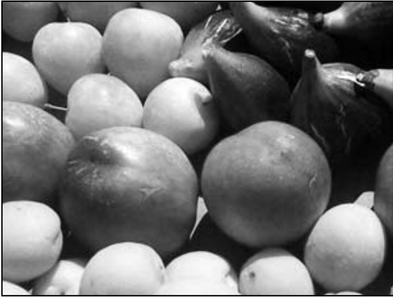
Lucious fruit from Chaffin Family Orchards.