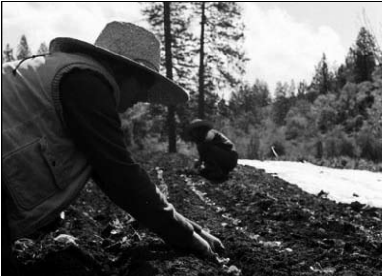
Planting at Mountain Bounty Farm.

In purely economic terms, even if you miss a couple of pickups or let a few items spoil, you are still getting a good deal because the cost of buying equivalent produce at the store is higher. So enjoy the lively flavors of truly fresh food that is harvested locally and seasonally, and don't sweat a little “waste.” You are actually wasting much less by engaging in our alternative food system.